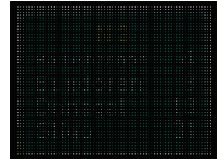
600-Hz scanner (Lynx HS-600) (b)*